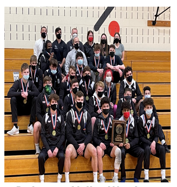
Delaware Valley Warriors Wrestling Camp 2021

1st-8th Grade June 28-July 1 9:00am- 2:00pm